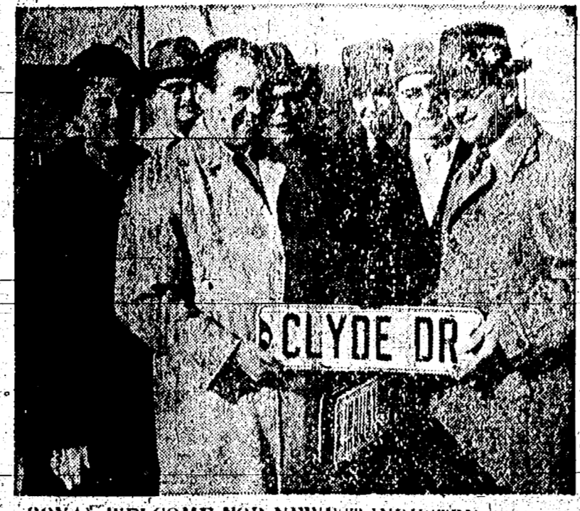
ROYAL WELCOME FOR NEWEST INDUSTRY—An Indiana firm locating in Coldwater became Michigan's first new industry of 1963...