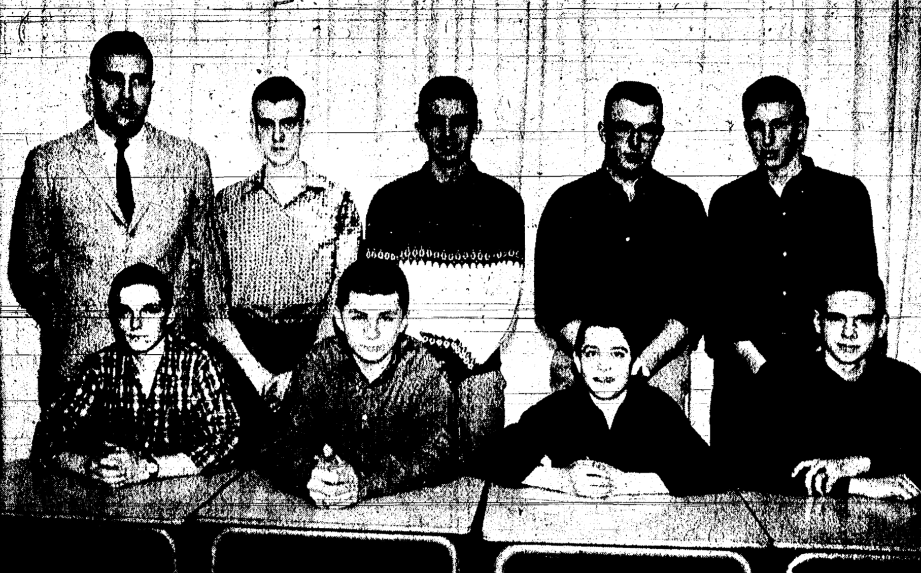
WIN DISTRICT CONTEST—Chelsea High school's parliamentary procedure team will compete in the regional FFA contests at Jackson Northwest High school Wednesday, Feb. 27, after winning first place in the district contest at Saline two weeks ago.

Share in Title Hinges on Dexter-U. High Contest Ann Arbor's U. High basketball team suffered its first conference defeat of the season in the game played at Chelsea Tuesday night, Feb. 19. The score was 68-49.