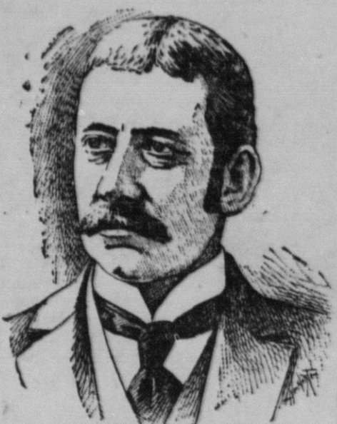
SECRETARY OF STATE ROOT. (Cabinet Official Who Is Making a Tour of South American Countries.)

The purpose of the trip, it is frankly stated, is to encourage better relations with our South American neighbors. Secretary Root will make a number of speeches and will talk personally with all the most distinguished statesmen of the South American countries. He will try to remove the