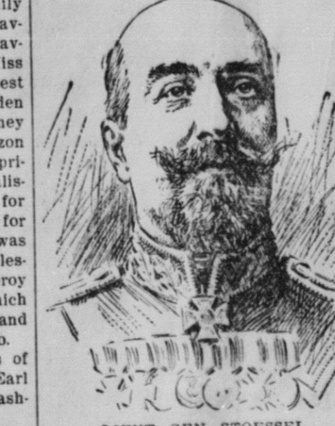
LIEUT. GEN. STOESEL.

St. Petersburg.—The commission appointed to investigate the surrender of Port Arthur has finished its labors and recommends that Lieut. Gen. Stoessel, the former commander of the Russian forces at Port Arthur, be dismissed from the army and shot.