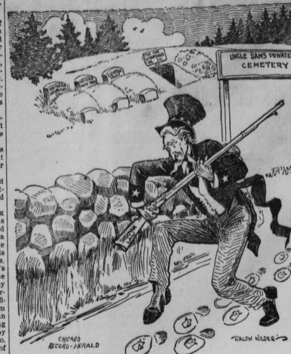
The Old Gun Shoots Straight—Sometimes.